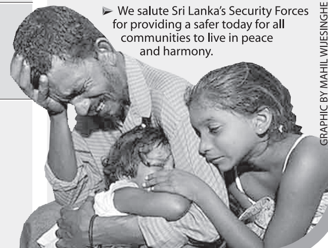
GRAPHIC BY MAHIL WIJESINGHE

► We salute Sri Lanka's Security Forces for providing a safer today for all communities to live in peace and harmony.