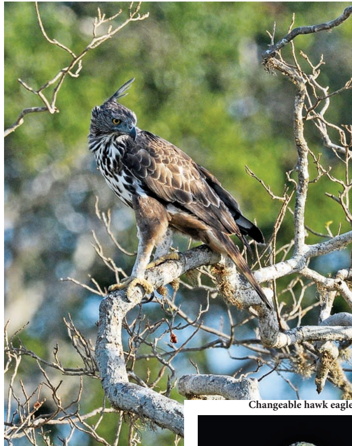
Changeable hawk eagle