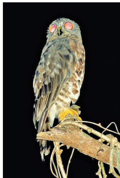
Oriental scops owl