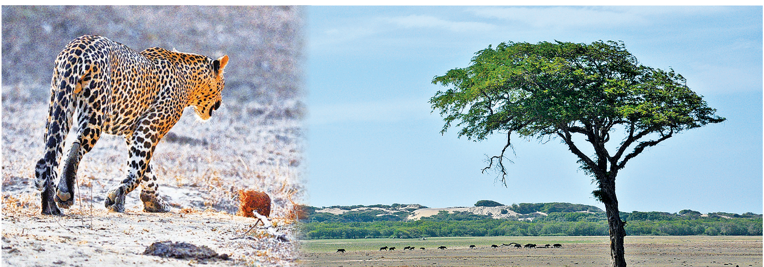
Sri Lankan leopard