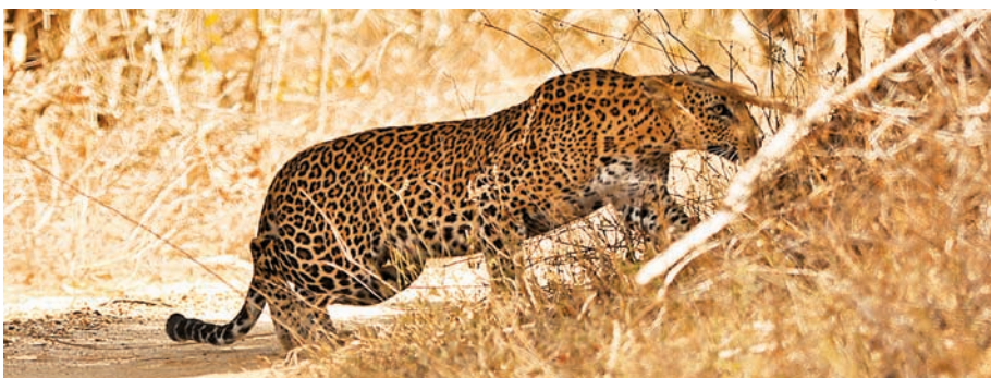
Sri Lankan leopard