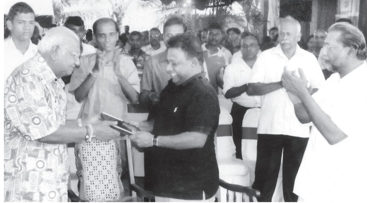
A ceremony was held at the "Keth Sevana" reception hall, Pokunuwita to mark the 61st anniversary of the Sri Lanka Freedom Party recently. Here Senior Minister for Good Governance and Infrastructure Facilities, Rathnasiri Wickramanayake, presents a memento to the Minister of Youth Affairs and Skills Development Dullas Alahapperuma.