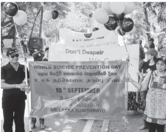
The Sri Lanka Sumithrayo, Colombo organised a Walk to mark World Suicide Prevention Day recently. Here the volunteers near Horton Place, Colombo.