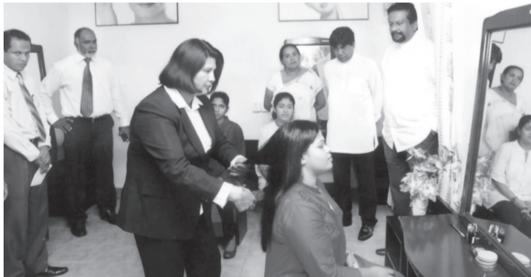
Minister of Foreign Employment Promotion and Welfare Dilan Perera and the Chairman, Sri Lanka Bureau of Foreign Employment Amal Senadhilankara at a session at the training centre of the SLBFE, which trains would-be Sri Lankan migrant workers.