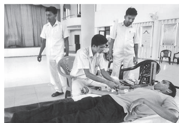
A blood donation campaign jointly organised by Akkaraipattu Municipal Council and the Akkaraipattu Base Hospital was held at the Athaulah auditorium recently. Here one of the State officials donates blood.