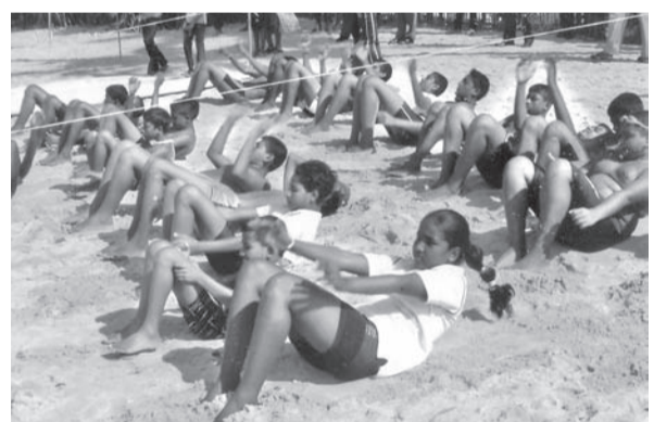
Competitors who took part in the swim at Polhena in Matara recently, engage in exercises before the event.