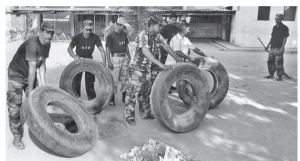
A shramadana campaign under the dengue-prevention program, to clean the environs of Addalaichenai Central College was organised by the Civil Volunteer Forces (CVF), with the School staff recently.