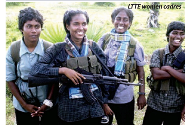
LTTE women cadres

■ Nov. 30, 2006: LTTE terrorists killed a fisherman and severely injured another in the seas North of Baththalangamuwa off Kalpitiya. The LTTE was forcing them to engage in unlawful activities such as transporting drugs, arms and ammunition and harassing them at sea. Navy boats rushed to the area and found a number of fishing boats abandoned. Among them was a body of a fisherman and another with serious injuries.