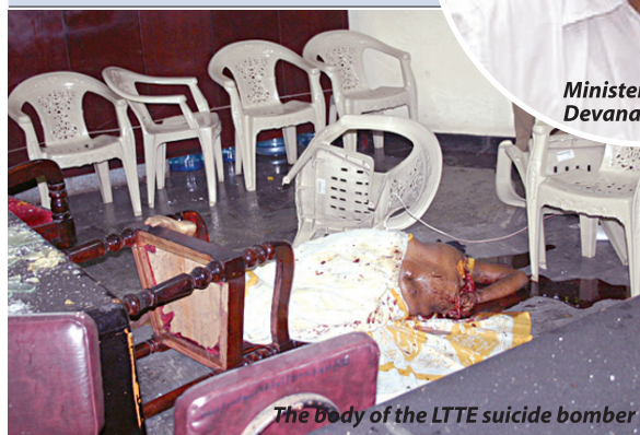
The body of the LTTE suicide bomber

■ Nov. 28, 2007: Nineteen civilians were killed and 39 were injured when the LTTE exploded a parcel bomb near a popular fashion store at Nugegoda junction. The parcel bomb had been placed in one of the parcel counters at the clothing store by an LTTE cadre who had left the scene. Several buildings were also damaged.