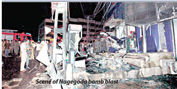
Scene of Nugegoda bomb blast

■ It is still fresh in people's memories how the LTTE terrorists carried out some of the most brutal bomb attacks during this period of time. This is the 44th in a series of graphic stories by the Sunday Observer on the anniversaries of those indiscriminate and inhuman attacks.