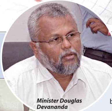
Minister Douglas Devananda

■ Nov. 25, 1996: A suicide bomber died in an attack on a police vehicle, which critically wounded a police driver in Trincomalee town.