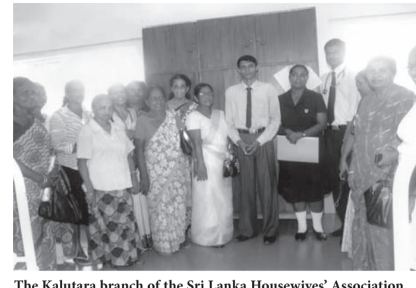
The Kalutara branch of the Sri Lanka Housewives' Association donated a set of wooden almirahs, purchased from the proceeds of the concert Tharu Vijaya , staged by the Association, to the Maternity Clinic of the Nagoda General Hospital, Kalutara recently.