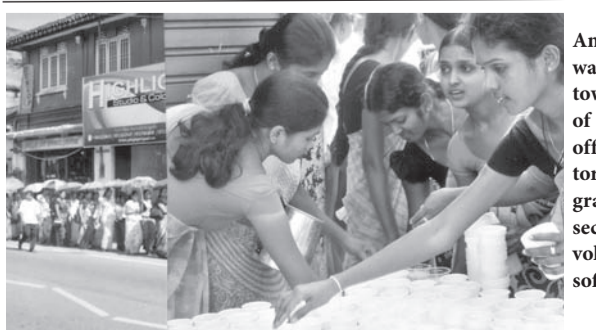
An anti-tobacco protest march was held in the Eheliyagoda town, with the participation of staff of the Eheliyagoda DS' office, Eheliyagoda police, Victory International College and graduate trainees. Here a cross section of the protesters and volunteers get ready with the soft drinks.