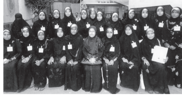
Young women who had completed a course in handwork organised by the Nasootha Foundation, Beruwala received their awards recently.