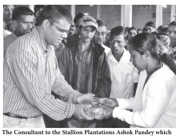
manages two premier estates, Waldemar and the Gordon Group of Estates in the Udapussellawa Plantations presents gifts and mementos to its workforce, in appreciation of their output of work, at a felicitation ceremony held recently.