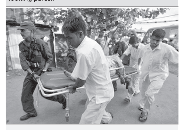
■ Dec. 20, 1985 : Six Madu pilgrims abducted by the LTTE eight days ago were executed by Tiger cadres in Mannar.

■ Dec. 19, 2008 : Another major disaster planned by the LTTE was averted when an LTTE suspect who attempted to explode a bomb inside a bus was arrested in Meegoda, Padukka. A policeman travelling in a packed CTB bus plying from Maharagama to Kurunegala observed the man carrying a suspicious looking parcel.