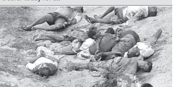
GRAPHIC BY MAHIL WIJESINGHE

We salute Sri Lanka's Security Forces for providing a safer today for all