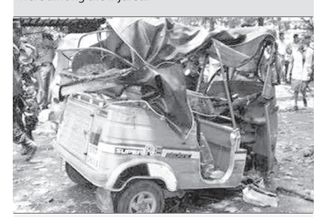
■ Dec. 18, 1999: Skandaraja Ashoka, an LTTE suicide bomber, detonated a bomb strapped to his body killing retired Major General Lucky Algama and 11 other at a United National Party (UNP) election rally at Ja-Ela

■ Dec. 18, 2007 : The LTTE failed with another public devastation when a Colombo bound train from Trincomalee was caught in a claymore explosion at Parakrama Road in Kantale. No one was injured but the engine suffered slight damage.