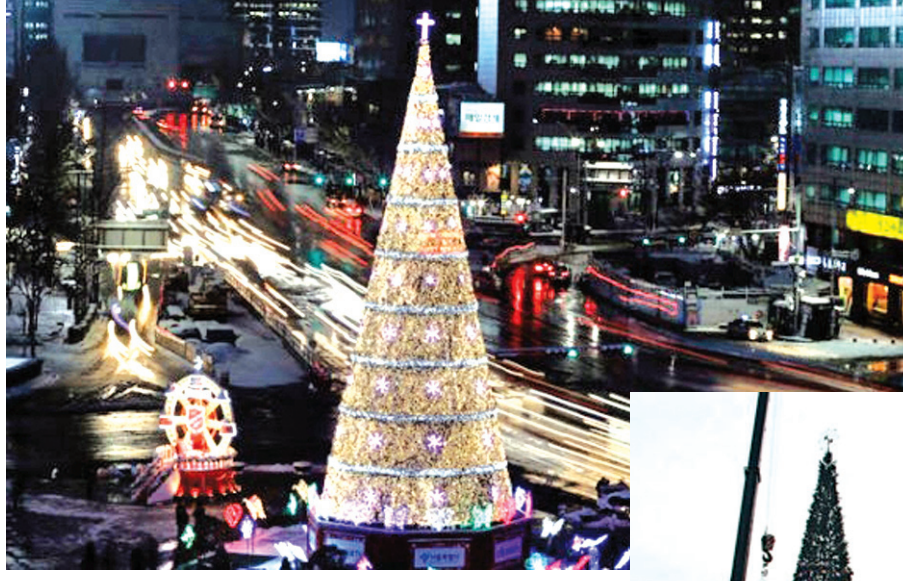
Seoul, South Korea - A Christmas tree is lit up to celebrate the upcoming Christmas holiday in front of City Hall in Seoul, South Korea.