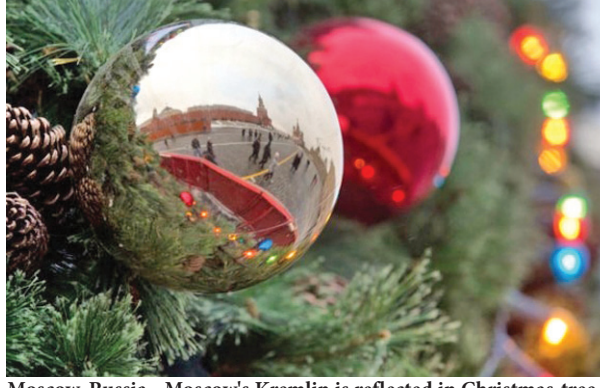
Moscow, Russia - Moscow's Kremlin is reflected in Christmas-tree decoration balls hung on a Christmas tree in Red Square. New Year's is the biggest holiday of the year in Russia.