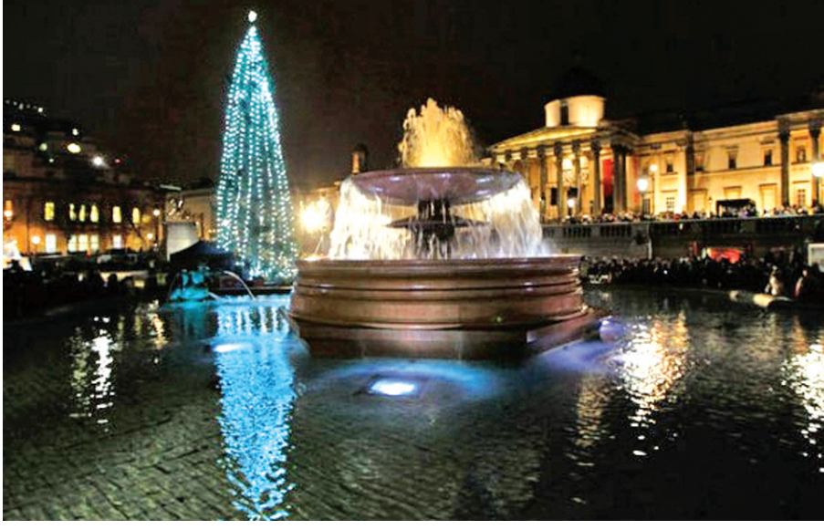
Trafalgar Square in London - The lit up tree is seen during the annual Christmas Tree lighting ceremony at Trafalgar Square in London. The tree is presented by the Norwegian capital of Oslo to the citizens of London as a token of gratitude for Britain's support during the World War II.