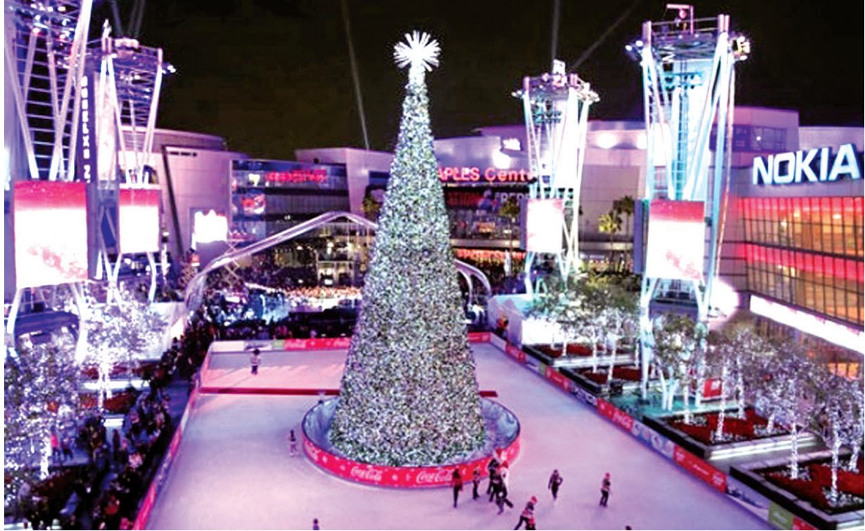
Los Angeles - The Holiday Tree is seen at the 5th annual Holiday Tree Lighting at L.A. Live and opening of LA Kings Holiday Ice, in Los Angeles.