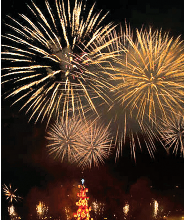
Rio de Janeiro, Brazil - Fireworks explode over a floating Christmas tree in Lagoa lake at the annual holiday tree lighting event in Rio de Janeiro, Brazil. The Christmas tree is believed to be one of the largest in the world decorated with millions of Christmas lights.