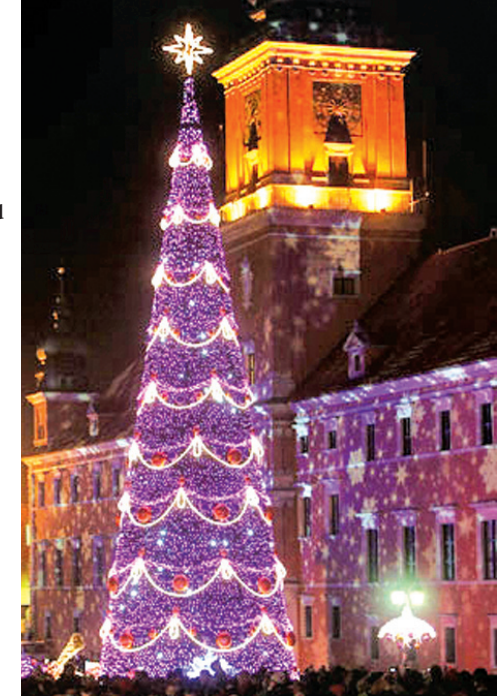
Warsaw, Poland - People enjoy the Christmas illuminations at the Royal Treaty street in Warsaw, Poland.