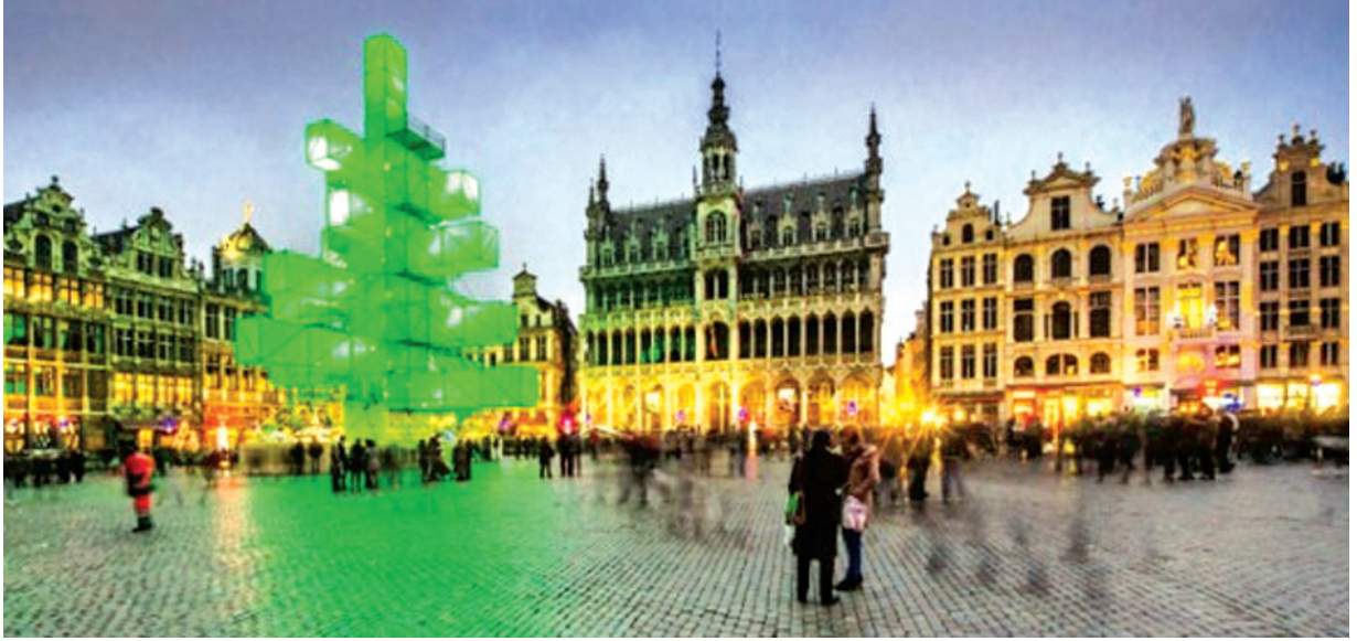
Brussels, Belgium - An abstract light installation replaces the traditional Christmas tree at the Grand Place in Brussels. Traditionally, a 20m (65ft) pine tree from the forests of the Ardennes decorates the city's central square, the Grand Place. This year, it has been replaced with a 25m (82ft) construction.