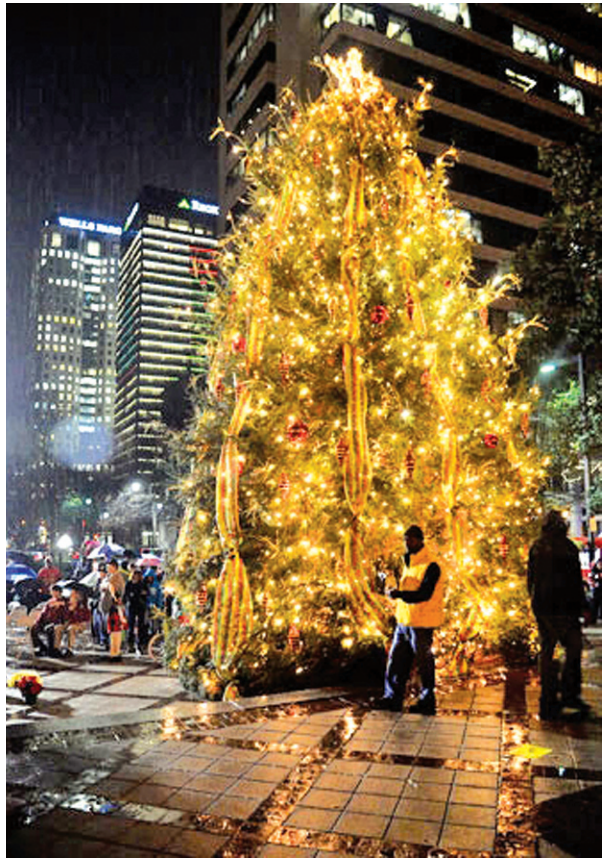
Birmingham, Ala. - The Birmingham Christmas Tree lights up Linn Park in downtown Birmingham, Ala.