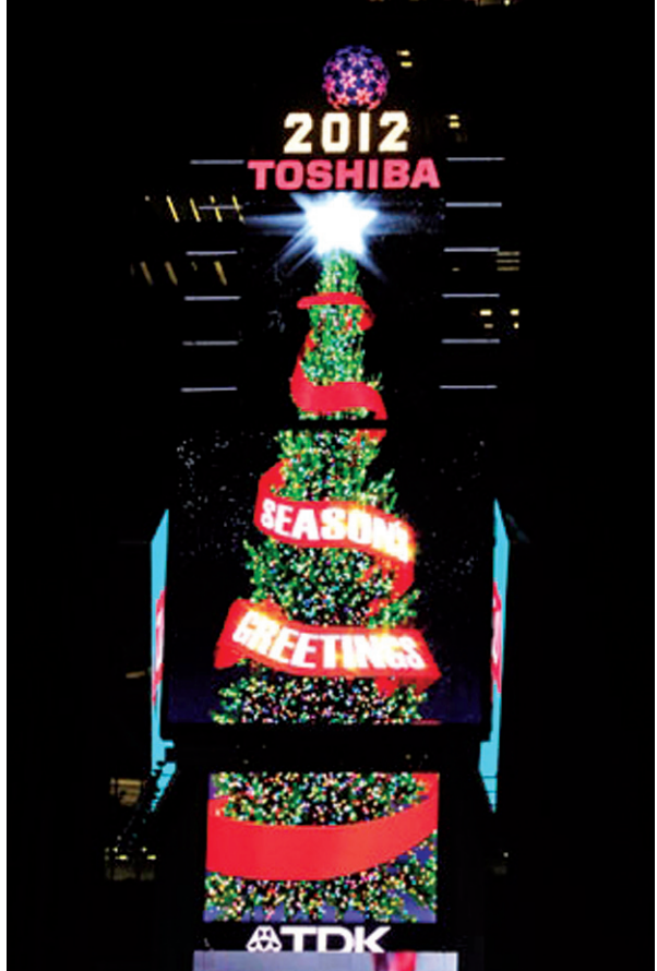
New York - A 130-foot tall digital Christmas tree is unveiled high atop One Times Square on the Toshiba Vision and TDK screens, in New York. The tree will deliver high-tech holiday greetings to the "Crossroads of the World," 24 hours a day, every 10 minutes, through January 13, 2013.