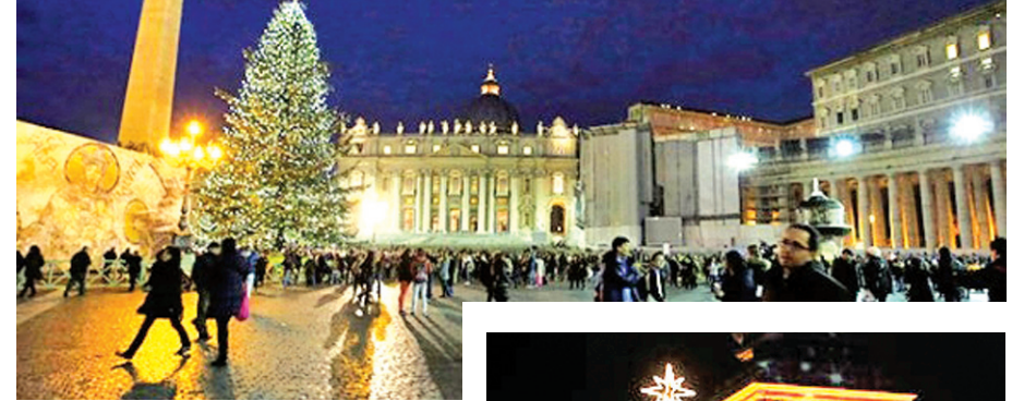
Vatican City - The 24 metres (78.74 feet) Christmas tree is lit in St. Peter's square at the Vatican. The Christmas season kicks off Friday at the Vatican with the traditional lighting of the tree in St. Peter's Square — and a reminder from the Pope about what happened when the "lights" of God were turned off in past atheistic regimes.