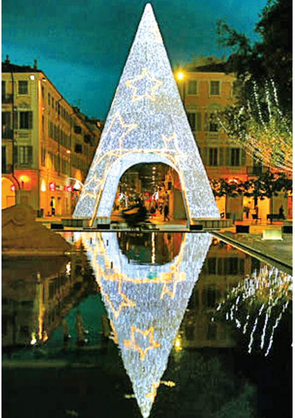
Nice, France - An illuminated pyramid is the design for Christmas lights in Nice, southeastern France.