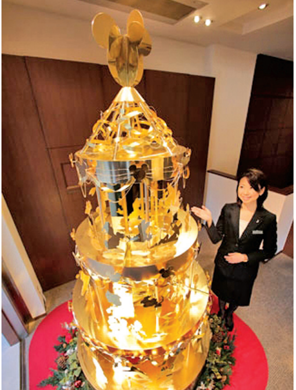
Tokyo - A sales clerk poses near a Christmas tree made of pure gold at jewelry store GINZA TANAKA in Tokyo. The 2.4-metre (7.8-foot)-tall and 43 kilograms (about 95 pounds) tree which is decorated with Disney characters, went on sale for 350 million yen (US$4.3 million).