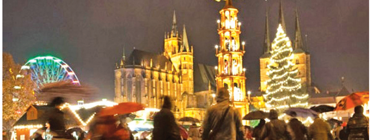
Erfurt, Germany - People walk at a Christmas Market during heavy rain in front of the Mariendom (Cathedral of Mary), left, and St. Severi's Church, right, in Erfurt, central Germany. The Erfurt Christmas Market is one of the most beautiful Christmas Markets in Germany. The square is decorated with a huge, candle-lit Christmas tree and a large, hand-carved nativity scene.