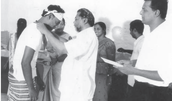
A ceremony to felicitate differently-abled athletes who won gold medals at the Western Province Athletic Competition won organised to mark World Disabled Day, at the Ingiriya Divisional Secretariat recently. Thirteen athletes of Ingiriya Divisional Secretariat division received medals, certificates and gifts from the personal funds of Kalutara district parliamentarian Vidura Wickramanayaka. Here the Parliamentarian presents a gold medal to an athlete.