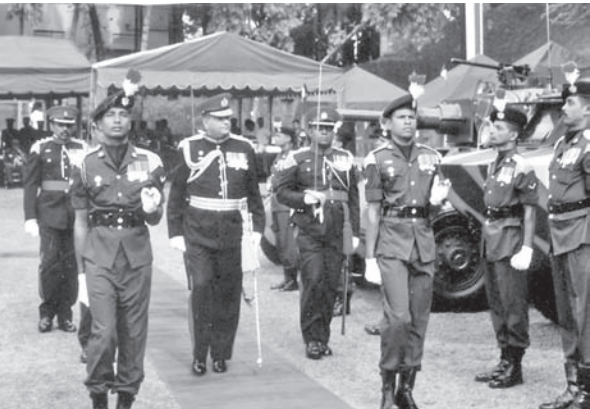
Army Commander Lt. Gen. Jagath Jayasooriya inspects the guard of honour at the Rock House Army Camp, Modera, Colombo recently to mark the 57th anniversary celebrations of the Sri Lanka Armoured Corp.