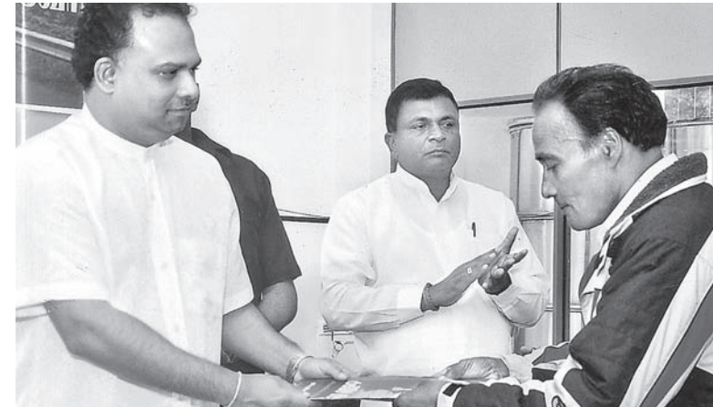
Sewing machines to the value of Rs. 800,000 were distributed among 40 self-employed persons under the Nuwara Eliya district Divi Neguma program by Minister of Public Management and Reforms Naveen Dissanayake at a function held in Nuwara Eliya recently.