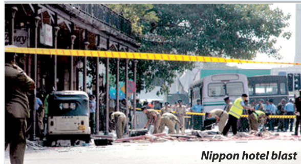
Nippon hotel blast

■ The United Nations Human Rights Council, several countries in the West and numerous INGOs have been voicing strongly against human rights and acts against mankind. But hardly any of those had taken any notable measure to stop LTTE terrorist act against civilians in Sri Lanka.