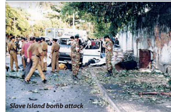
Slave Island bomb attack

■ Jan. 2, 2009: A LTTE suicide bomber blew himself up killing three persons, including two Airmen, and injuring 37 others at the entrance to the Air Force camp in Slave Island in Colombo. An accomplice of the suicide bomber was arrested from the incident site.