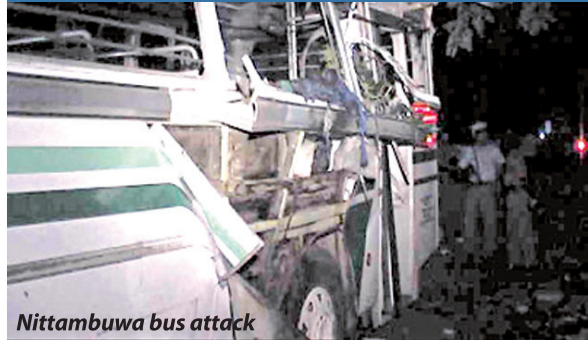
Nittambuwa bus attack