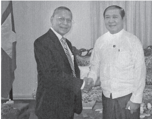
President of the Sri Lanka Chamber of Small and Medium Industries Kumara Semage met the Union Minister of Industry U. Win Myint at the Ministry of Industry of the Union of Myanmar at the Nay Pyi Taw, Myanmar.