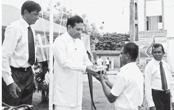
Minister of Fisheries Dr. Rajitha Senaratne was the chief guest at the passing-out of Naval Ratings trained by the Lanka Academy of Technological Studies (Pvt) Ltd at the Moratu Modera Fisheries Harbour recently. Here the Minister presents a certificate to a new rating.