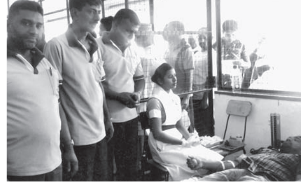
A blood-donation campaign organised by the All Ceylon YMMA Conference Madawala Bazaar branch of the Central Region (Kandy and Kurunegala) was held at Madina Central College recently. Here a youth donates blood.