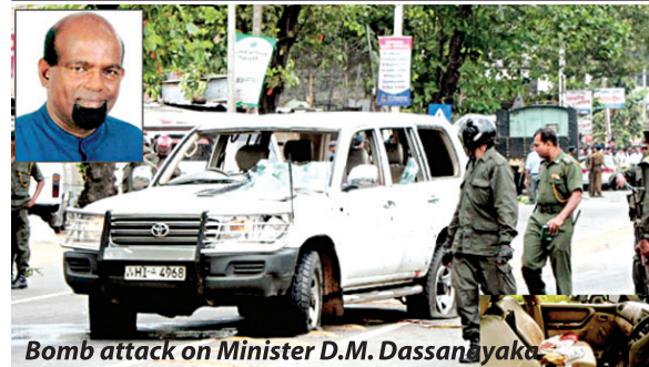
Bomb attack on Minister D.M. Dassanayaka

■ Jan. 7, 2000: An LTTE suicide bomb attack killed Industries Minister C.V. Gooneratne in Dehiwela.