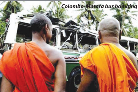
Colombo-Matara bus bombing