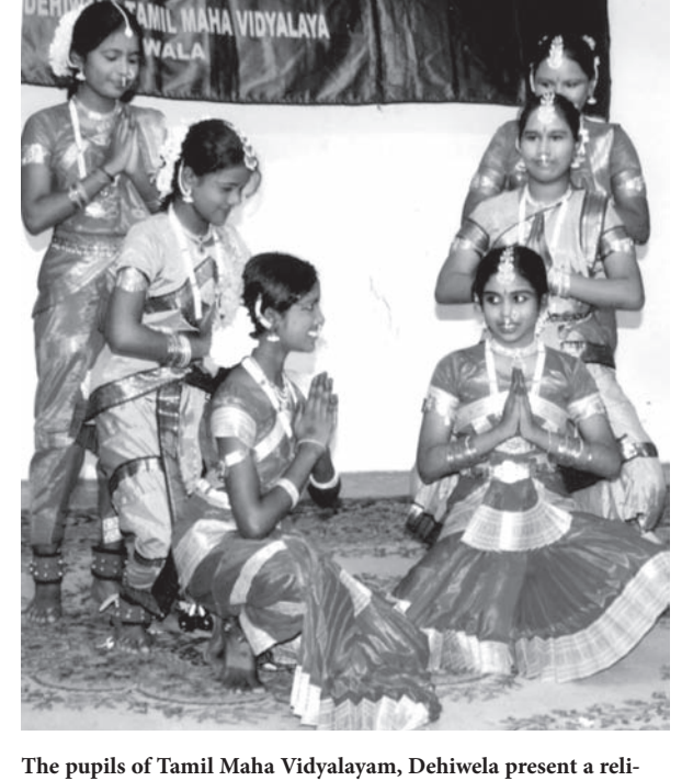
gious dance item at the annual prize-giving at the Colombo Tamil Sangham, Wellawatte recently.