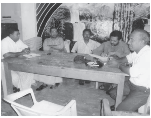
The executive committee of the newly formed Puttalam District United Journalists' Association convened its first meeting at the Puttalam Town Hall recently.

melodies can be enjoyed by all, the organisers said.