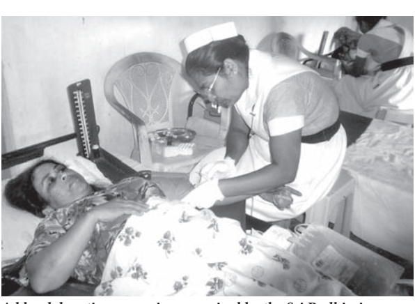
A blood donation campaign organised by the Sri Bodhiraja Dhamma School, Pallewatte, in collaboration with the National Blood Bank was held at the Pallewatte Community Centre in Ginigathena recently. Here a woman volunteer donates blood.

The 40th Annual General Meeting of the National Council for the