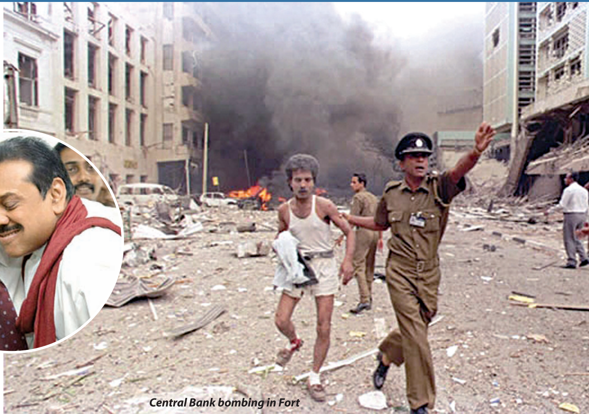
Central Bank bombing in Fort

■ In the guise of so-called liberation to Tamils, LTTE terrorists inflicted untold misery on hundreds of thousands of innocent civilians, including their own community. It is still fresh in people's memories how the LTTE terrorists carried out some of the most brutal bomb attacks during this period.