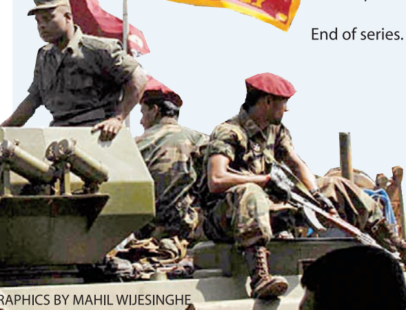
GRAPHICS BY MAHIL WIJESINGHE

We once again salute Sri Lanka's Security Forces for providing a safer today for all communities to live in peace and harmony. All Sri Lankans must rally round to protect this hard-earned peace.