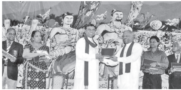
The annual exhibition The Sethawaka Abimana was held at Siri Priyarthana Vidyalaya, Padukka recently. Here the chief guest Minister of Economic Development Basil Rajapaksa receives the Award of appreciation from the Minister of Water Supply and Drainage Dinesh Gunawardena.