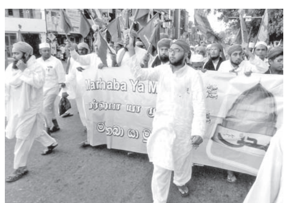
The Faizal-E-Madina at Messenger Street, Colombo organised the Meelad procession recently. Here the organisers parade the streets.