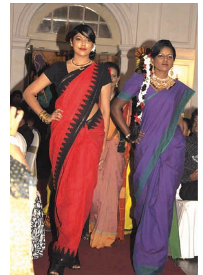
Northern Province contenders