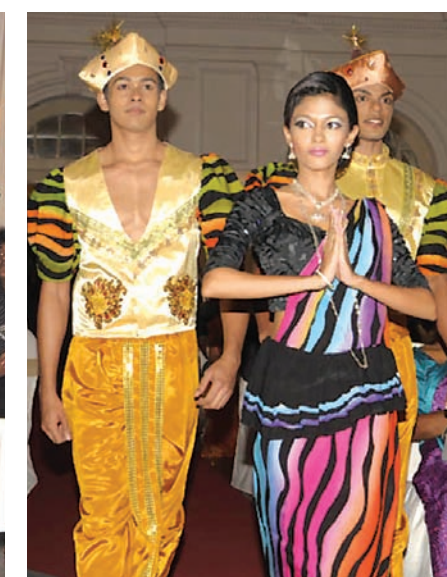
Central Province contenders