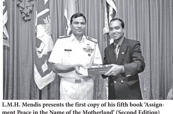
ment Peace in the Name of the Motherland' (Second Edition) to Commander of the Western Naval Area Rear Admiral Rohan