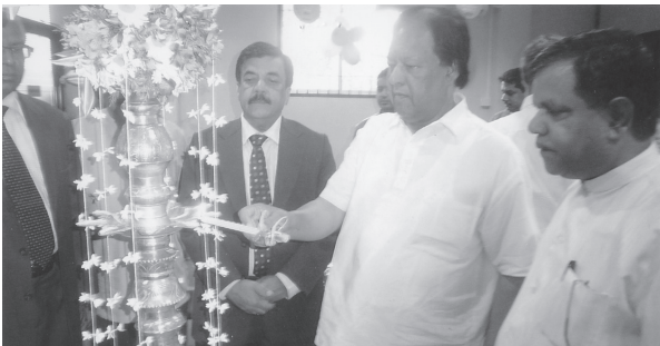
The 222nd branch of the National Savings Bank (NSB) was opened in Ginigathena by Senior Minister of International Financial Co-operation and Deputy Minister of Finance Dr. Sarath Amunugama recently. Here Dr. Amunugama lights the oil lamp to mark the occasion.