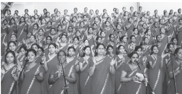
A group of women devotees of the Jesus Lives International Evangelical Ministry, Aluthmawatha, Modera, Colombo render a devotional song at the 35th Annual Convention Festival at the Galle Face Green recently.