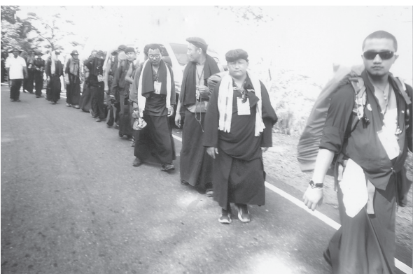
The participants of the Pada Yathra organised by the Presidential Secretariat, NYSC Youth Clubs Federation and the Tharunyata Hetak Organisation with participants from 17 Asian countries go in procession from Kaduwela Tamil School to Ginigathena town on their way from Kataragama to Jaffna.