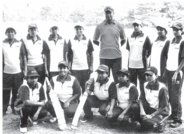
The Kalutara Pradeshiya Sabha Women's cricket team emerged champions at the Kalutara District State Institutions Sports Festival 2013, at the Kalutara esplanade recently. Here the Kalutara P.S. Women's Cricket team with their coach.