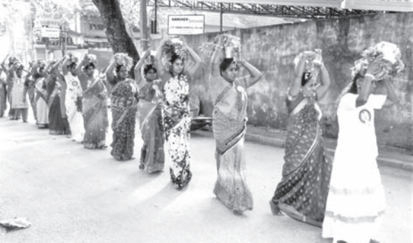
The Pal Kudam Bawani (Holy Milk procession) to invoke blessings on the country and the people was held at the Poomanammankovil, Perahera Mawatha, Colombo 2 recently. Here women devotees carry milk pots in a procession from the Saiva Munnetra Sangam to the kovil.