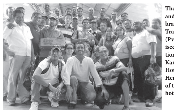
The main office and the Kandy branch of The Traveller Global (Pvt.) Ltd organised a familiarisation trip to the Kandy Citadel Hotel recently. Here the members of the staff at the hotel.