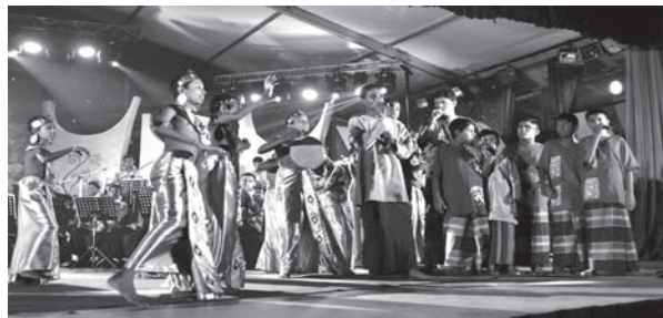
The Geethma Musical Show to project the artistic talents of students of Nalanda College was held at the BMICH recently. It was organised by the parents of the members of the School Western band. Here an event in progress.