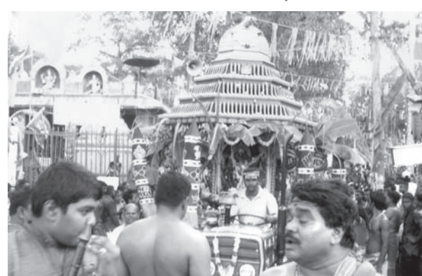
The annual Vel festival of the Neboda, Muthu Meenatchi Kovil was held under the patronage of Ports and Highways Project Minister Nirmala Kotalawala recently. Here the Vel Cart taken in a procession from the kovil.