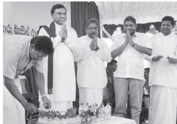
The birthday of Minister of Transport, Kumara Welgama which was celebrated with a donation from the 'Kumara Welgama Bhikkhus Care Unit' to the Panadura Base Hospital, at a cost of Rs. 10 m was opened under the patronage of National Organiser of the SLP and Minister of Economic Development Basil Rajapaksa. Here Minister Welgama cuts the cake after the opening ceremony. Dr. Itthepane Dhammalankara Nayaka Thera, Minister of Minor Export Crop Promotion, Reginald Cooray and Minister of Health WPC Jagath Angage were also present.