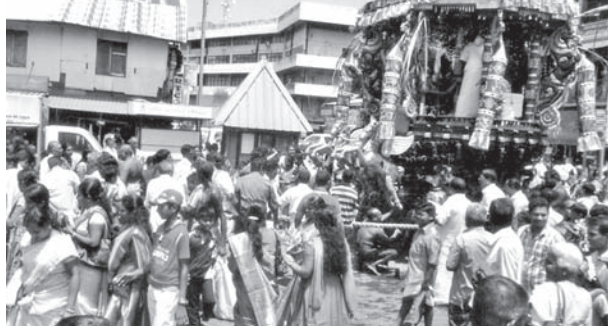
The annual Ther (chariot) festival of Sri Muthu Vinayagar Swamy Kovil, Sea Street, Pettah was held to mark the Sinhala and Tamil New Year. Here the Vinayagar in a golden chariot wends its way through the streets of Colombo.