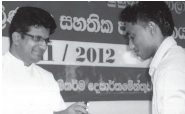
The certificate-presentation ceremony for trainees of Agricultural Course was held under the patronage of Western Province Agriculture and Environment Minister Udaya Gammanpila recently. Here the Minister presents an award to a student.