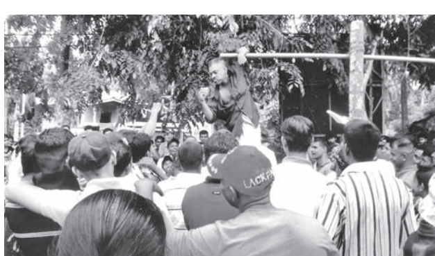
The Bak Maha Ulela organised by the Maha Ingiriya Youth Club was held at the Parakramabahu Primary College playground, Ingiriya recently. Here a new event, Maru Dande Mari Kemo in progress.