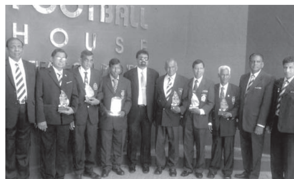
The Sri Lanka Football Federation felicitated the members for their contributions in the advancement of the game at the Annual General Meeting held recently. Here the members with their mementos.