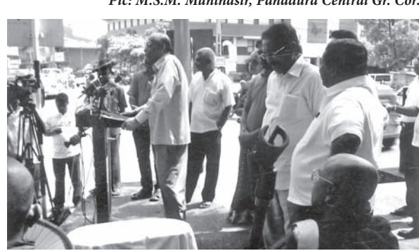
The 112th birth anniversary of the late Dr. S.A. Wickramasinghe, was held at Hakmana Road, Matara recently. Here Senior Minister, DEW Gunasekara addresses the gathering.