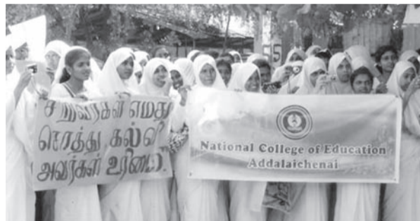
The teacher-trainees of the Addalaichenai National College of Education visited Kinniya Muslim Ladies School in the Trincomalee district recently. Here the trainees with the lecturers.