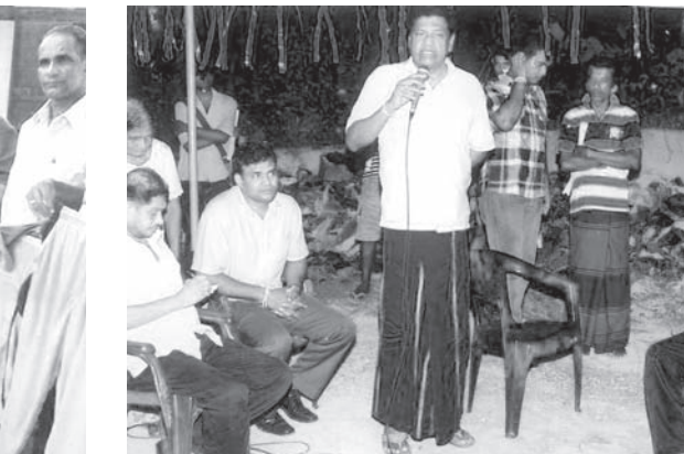
The Thebuwana rural electricity distribution system was commissioned by Transport Minister Kumara Welgama in Kalutara district recently. Here the Minister addresses the gathering.