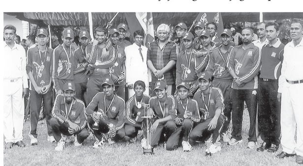
A cricket match between Royal College, Horana and Sreepali College, Horana was held at the Sreepali College grounds recently. Here the Sreepali team which won the match with Kalutara district parliamentarian Arjuna Ranatunga.