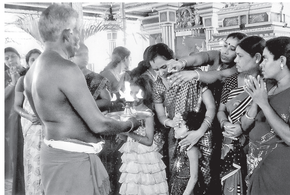
The annual festival of Sri Sithy Vinayagar Kovil was held recently at Pandiruppu, Kalmunai.