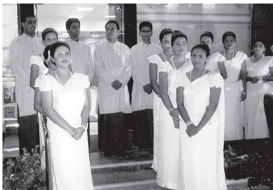
The Bank of Ceylon, Supra Grade branch, Kotuwegoda, Matara held its Bakthi Gee recital at its office on Vesak Poya Day.