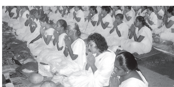
A Kiri Ammarunge Dane (Alms-giving) organised by the villagers of Polwatta, Kottawa, to mark the 2,600th Sri Buddha Jayanthi and Vesak Festival was held recently at the Polwatta Sudarmaramaya temple.