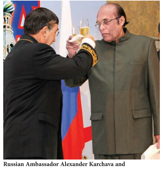
Minister D.E.W. Gunasekera