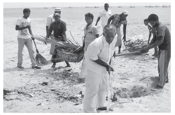
The fisher community of Kalmunai organised a Shramadana campaign to mark World Workers' Day at the Kalmunai Barakkath Beach Park. Here the fisherfolk clean the sea shore.