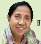
BY MAHES PERERA

The workshop that was held on June 23 held for the benefit of contestants. Demonstrations focussed bridal dress. Contestants were given a professional insight into designing the bridal dress, the embroidery that brides request, the correct method in making adjustments if necessary, the overall finish and choice of fabric. In keeping with modern times the Future XL 400