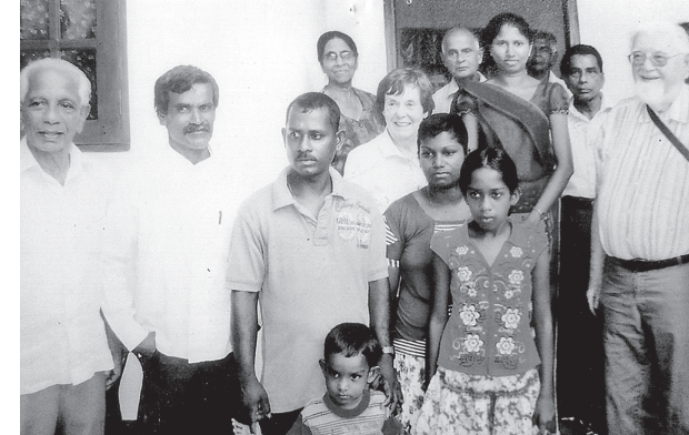
Two houses were built at a cost of over Rs.10 lakhs for two low income group families at Miyanakolattenna, a remote village, seven miles off Eheliyagoda town by the Sri Lanka-Belgium Association. Here the officials of the Association with the beneficiaries.