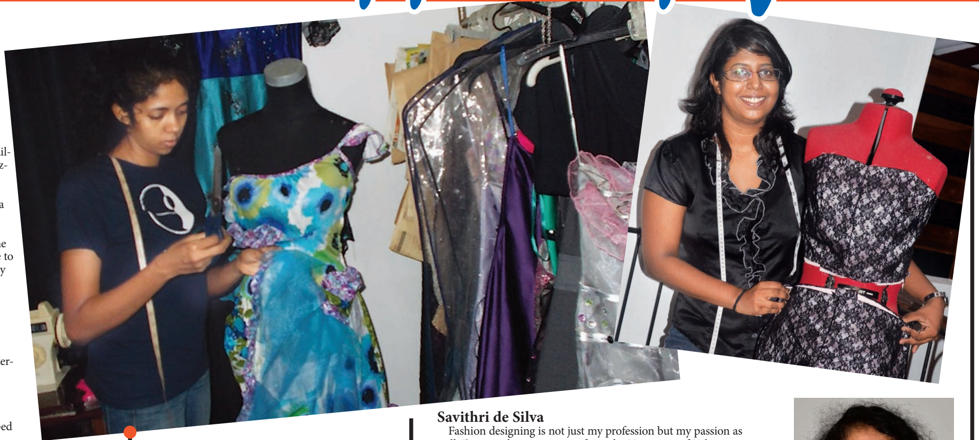
The B52 Cats Dance will give all ticket holders the opportunity to enjoy themselves on July 27 and 28.

The sponsors of the show are the Grand Oriental Hotel the official hotel, Sterling Flowers, Semage Mirrors, Mal Key Rent-a-Car, Beautine Astron, Furnifits, Ferla Apparel Tec, Rite Shu and Imagine Works.