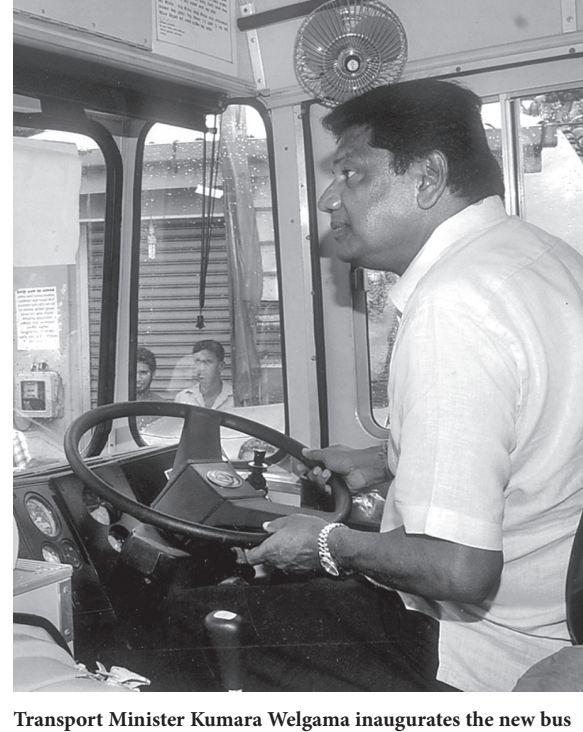
service between Panadura and Thotawatta recently.