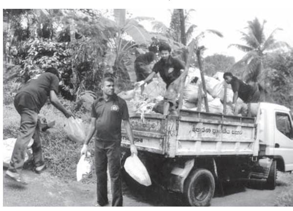
A shramadana campaign for three consecutive days, organised by the Raigam Janapada Mithuru Hawla, with the assistance of Horana Pradeshiya Sabha was held in Ingiriya recently, to control dengue. Here Society members clean the area.