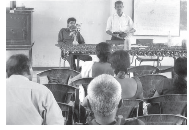
Batugahapitiya 'Vidatha' Centre, Eheliyagoda held a series of workshops to educate housewives and unemployed persons in the villages in selfemployment ventures recently. Here a group of villagers listen to a lecture on 'mushroom cultivation'.