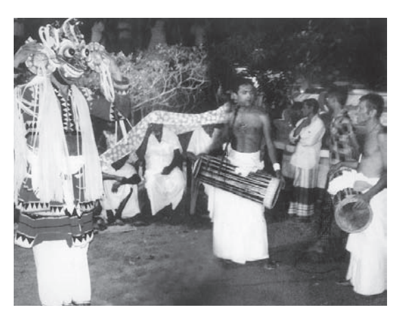
dance of Gara Yaksha, organised by the Sri Wijeya Bodhiraja temple, was held recently. Here a dance item in progress.