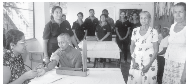
The Bank of Ceylon, Kadawatha held a medical camp recently, under the patronage of the Kirimetiayage Adults' Association.