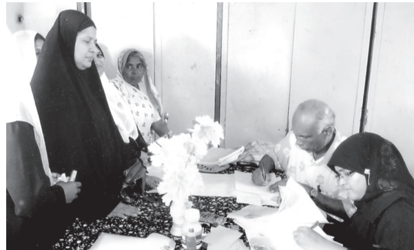
Residents of Manalkundu village in Puttalam received their National Identity Cards at the mobile service, organised by the Divisional Secretariat, Puttalam, in collaboration with the Manalkundu Young Star Youth Club.