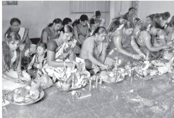
The Varalakshmi Viratha pooja organised by the Poomari Amman Kovil, Nellikawatta Peliyagoda was held recently, at the kovil. Here a group of devotees at the ceremony.