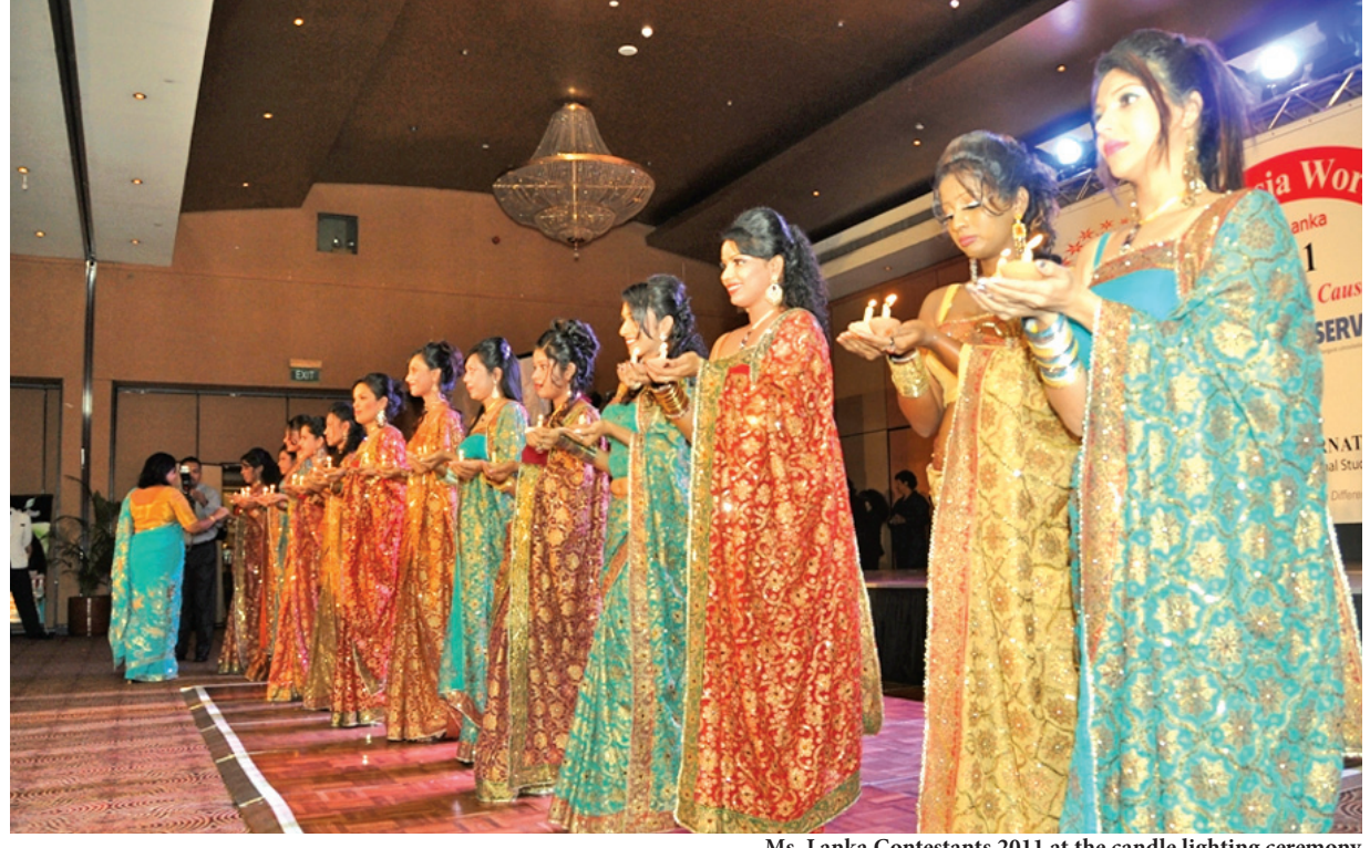
Ms. Lanka Contestants 2011 at the candle lighting ceremony