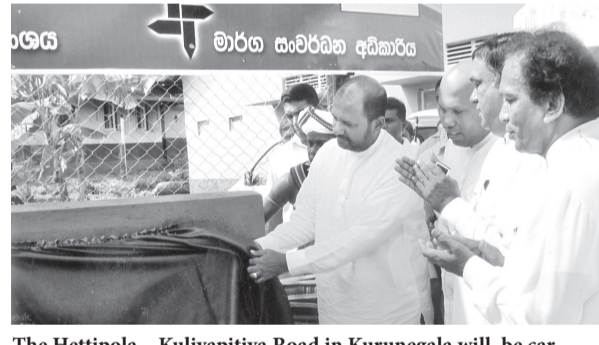
The Hettipola - Kuliyapitiya Road in Kurunegala will be carpeted at a cost of Rs. 1,115 million under a Bank of Ceylon credit scheme. Here Nirmala Kotalawala, Project Minister of Highways and Ports, the chief guest unveils the plaque at the inaugural ceremony. Indika Bandaranayake, Deputy Minister of Local Government and Provincial Councils, the SLPF chief organiser for Panduwasnuwara is also in the picture.