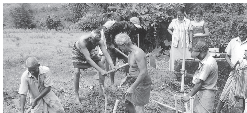
Farmers of Wiyalagoda-Thibbotuwawa Govi Sanvidhanaya, Eheliyagoda conducted a shramadana campaign to restore the flood-damaged Beligahakumbura dam that supplies water 55 acres in the area recently.