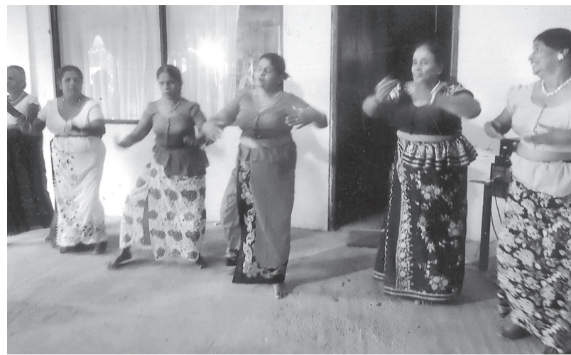
The fifth anniversary of the Kalyani Elders' Society, Makola, Sapugaskanda was held at Sri Kalyaniwansa Dhamma School recently. Here a few elders perform a dance item.