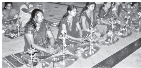
The Thiruvilakku pooja organised by the Shri Venkateswarar Maha Vishnu Kovil, Modera Colombo 15 was held recently to mark the Kovil's annual Ratha Festival. Here the ceremony is in progress.