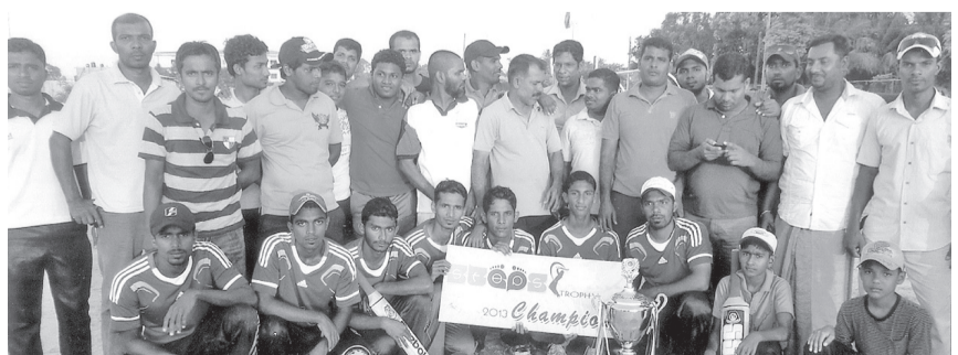
Sober Sports Club, Addalaichenai beat Hard and Soft SC, Akkaraipattu in the finals to emerge champions in the Seven-a-Side Limited 5 Overs cricket tournament conducted by Steps (Pvt) Ltd, Akkaraipattu at the Akkaraipattu public grounds recently. Here the winning team with their supporters.