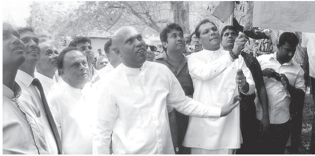
A building complex for the Giribawa PS in Galgamuwa will be constructed at a cost of Rs. 29m under the Pura Neguma project of the Ministry of Local Government and Provincial Councils. Here Deputy Minister of Local Government and Provincial Councils Indika Bandaranayake, NWP Chief Minister Dayasiri Jayasekera and Senior Minister S.B. Nawinna unveil the nameboard.