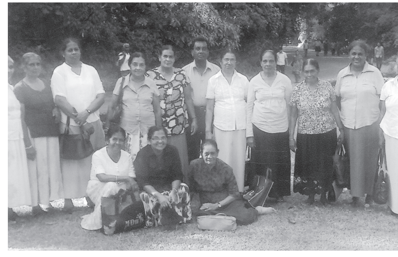
The annual-get-together of the Retired Nurses Union of the Negombo General Hospital was held at the Peradeniya Botanical Gardens recently.