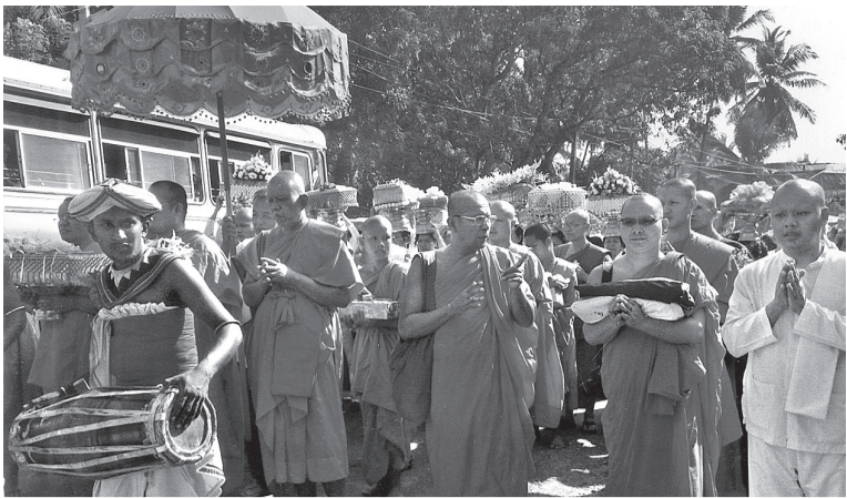
The Katina pinkama of the International Cambodian Buddhist Centre, Kaduwela was held recently, in keeping with Cambodian traditions. The religious activities were conducted by devotees from France, Switzerland, USA, New Zealand, Australia and Cambodia. Here the foreign devotees at a religious program.