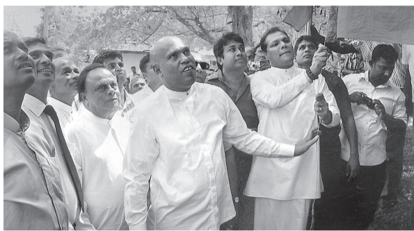
A building complex for the Giribawa PS in Galmuwa will be constructed at a cost of Rs. 29m under the Pura Neguma project of the Ministry of Local Government and Provincial Councils. Here Deputy Minister of Local Government and Provincial Councils Indika Bandaranayake, NWP Chief Minister Dayasiri Jayasekera and Senior Minister S.B. Nawinna unveil the nameboard.