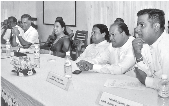
Minister of Power and Energy, Pavithra Wanniarachchi presides at a meeting convened at the Puttalam District Secretariat to discuss problems faced by fishermen in Puttalam, due to a decision taken by the Ceylon Electricity Board to erect electricity posts across the lagoon.