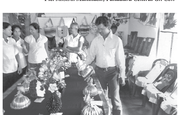
An exhibition of craft products of 20 trainees who had completed a one-year women's progressive training course organised by the