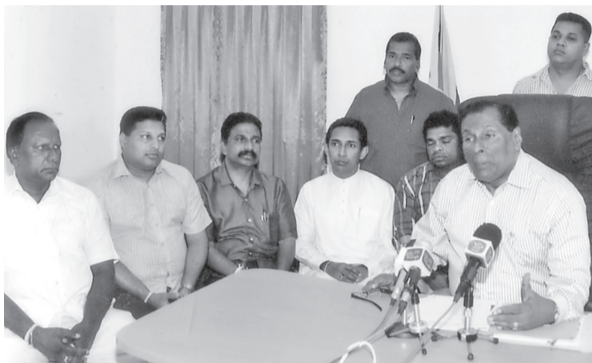
UPFA candidates in the Kalutara district for the Western Provincial Council election held a meeting in Kalutara under the patronage of Public Administration and Home Affairs Minister, W.D.J. Senviratne recently. Here the minister addresses the gathering.