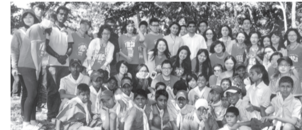
The Kandy YMCA with several youth from the Taiwan YMCA and the Kandy Municipal Council organised a shramadana at the Kandy Municipal General Cemetery recently, under the patronage of Mayor, Mahen Ratwatte. Fifty-eight teenagers from Taiwan and Kandy YMCA participated. Mayor Ratwatte is also in the centre.