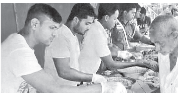
Satha Sarana, the Three-Wheel Drivers' Association of Mundel held an alms-giving to seek protection from fatal accidents in the Mundel Police Division.