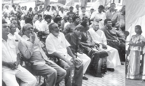
The 26th death anniversary of actor, singer, politician Vijaya Kumaratunga was held recently at the Vijaya Kumaratunga Conference Hall, Eheliyagoda, with the participation of cabinet ministers, politicians, the clergy and a large number of Vijaya supporters.