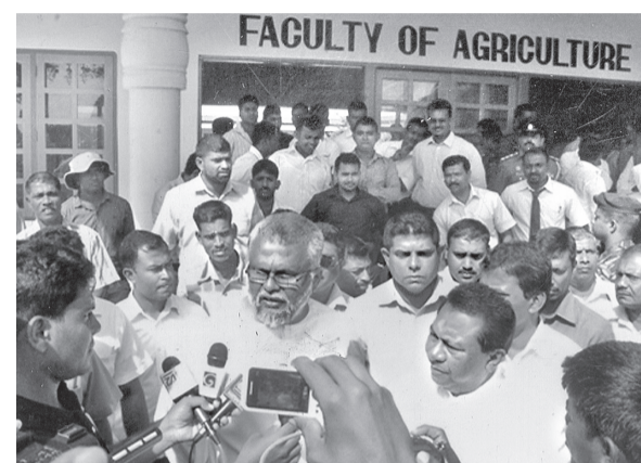
Higher Education Minister S.B. Dissanayake laid the foundation stone for the new buildings of the engineering and agricultural faculties of the Jaffna University. Here Minister and Traditional Industries and Small Enterprise Development Minister Douglas Devananda speaks to the press.