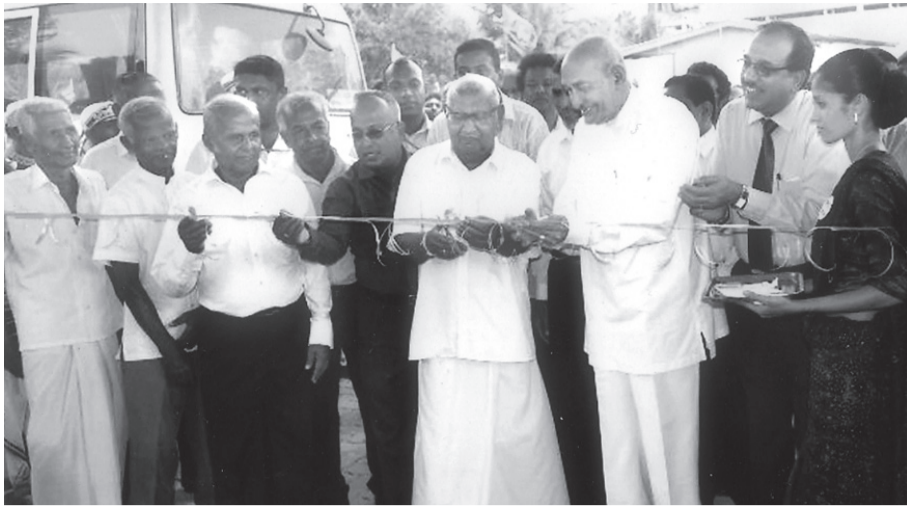
The new Paradise Garden filling station at Gurugoda, Horana run by the Raigam Udugahapattu Multi Propose Co-operative Society was opened recently, at a cost of Rs. 50m, on an initiative by Good Governance and Infrastructure Facilities Minister, Ratnasiri Wickramanayaka and the Governor of the Western Province, Alavi Mow-lana. Here the VIPs and well-wishers at the opening ceremony.