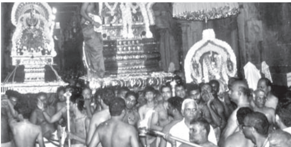
The annual Ther (Chariot) Festival of Sri Ponnambalawaneswarar Sivan Kovil, Kochikade, Colombo 13 was held recently. Here the deities being taken in a procession by the devotees before being placed on the chariot.