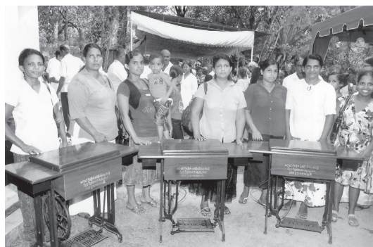
Sewing machines were donated recently to women engaged in self-employment in Horana, on an initiative by Good Governance and Infrastructure Facilities Minister Rathnasiri Wickramanayaka. Here a section of the beneficiaries with the sewing machines.