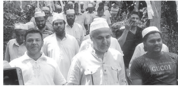
A road project in Inigala was launched recently by the Minister of Justice, Rauf Hakeem with funds from his decentralised budget. Here the Minister is being conducted to the project site. Inigala Jummah Mosque President, H.M. Ismail Ismath is also in the picture.