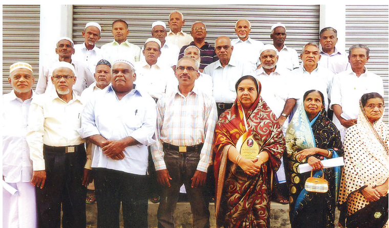
The get-together of the GCE (O/L) batch of 1959 students of Zahira, College, Kalmunai was held recently at the Mamas Restaurant, Kalmunai.