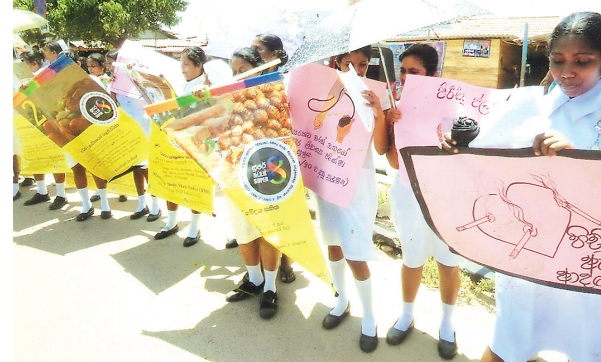
The staffers of the Puttalam Base Hospital hold placards at a rally to create public awareness on "The easiest way for a healthy life" recently.