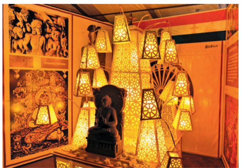
The Indian High Commissioner participated in the Buddha Rashmi Vesak celebrations organised by the Presidential Secretariat and the Gangaramaya Temple. Here a vesak lantern modelled on the Mahabodhi Temple in Gaya, Bihar that was displayed by the High Commission.