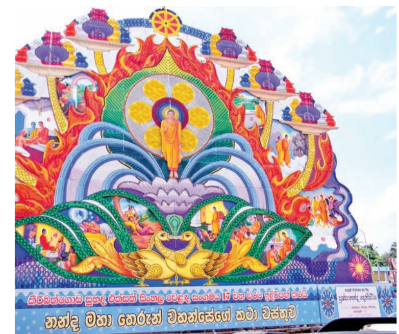
Minister of Economic Development Basil Rajapaksa was the chief guest at the opening of the vesak pandal erected by the Ajith Subasinghe Foundation at Gothatuwa New Town, IDH junction. Minister Rajapaksa, flanked by Kolonnawa SLP chief organiser Duminda Silva and Ajith Subasinghe, admiring the vesak pandal.