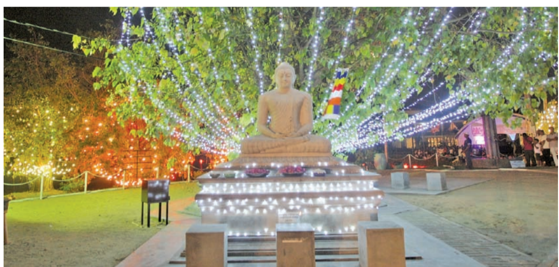
The Diyawanna Vesak Zone.