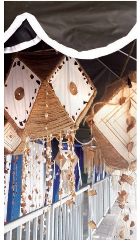
Vesak lanterns at the Visakha Vidyalaya premises.