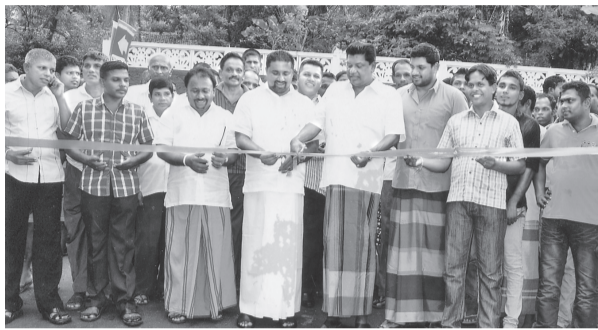
Transport Minister Kumara Welgama and Deputy Minister of Ports and Shipping, Rohitha Abeygunawardene open the newly carpeted Nagoda-Malabada Road in Matugama while Western Provincial Councillor Rohana Abeygunawardene and Senal Welgama look on.