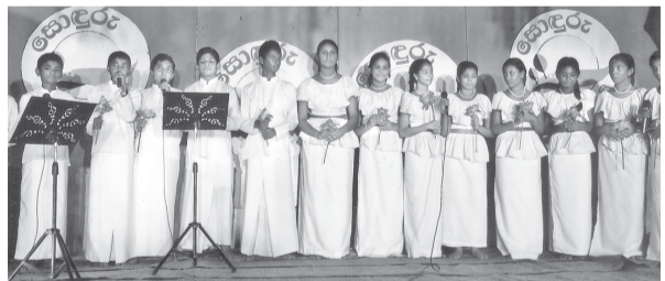
A Bakthi Geeth program was held at the Sri Sunethramaya Vihara, Kotte on Vesak Poya Day, under the patronage of a large number of devotees.