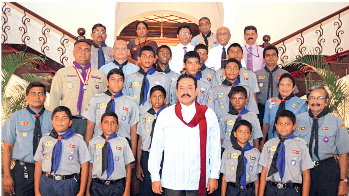
President Mahinda Rajapaksa with scouts after launching the Scouts and Public relations two-week program