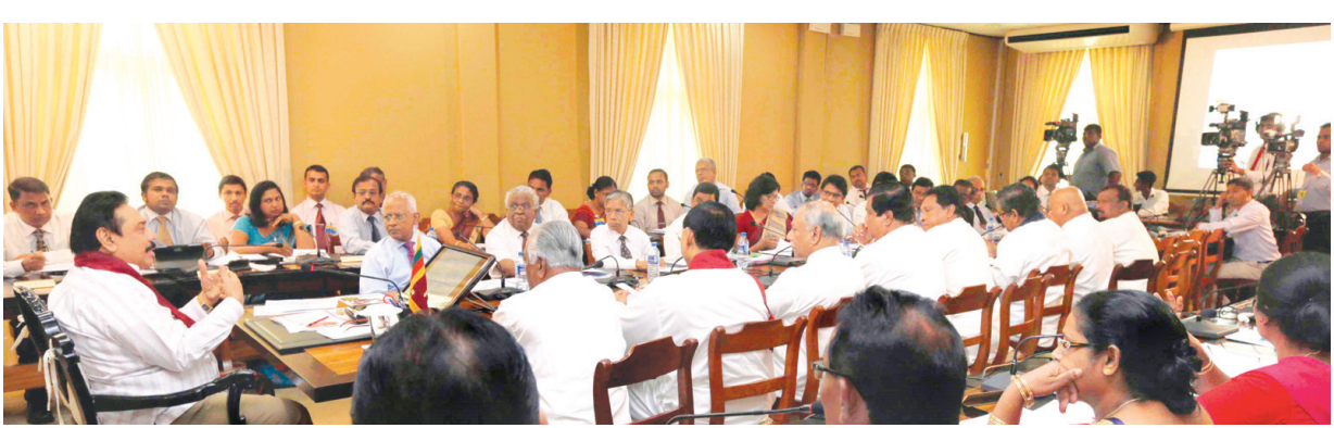
President Mahinda Rajapaksa chairs a meeting of representatives of the Presidential Task Force on preventing kidney disease.