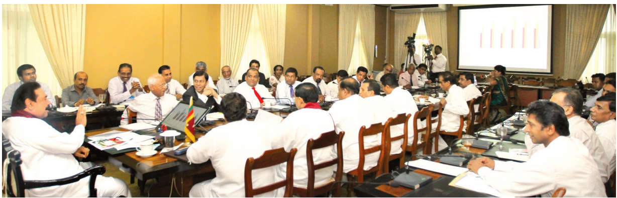
President Rajapaksa leads a discussion of the Ministerial Sub Committee on Food Protection and Living Index at Temple Trees.