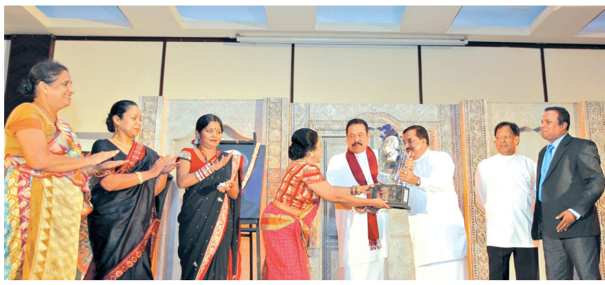
Prof. Ediriweera Sarachchandra's birth centenary celebrations were held under the patronage of President Rajapaksa.