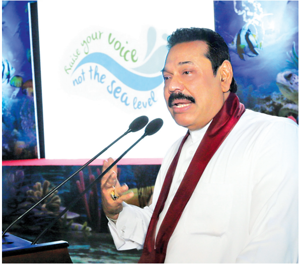
President Rajapaksa addresses a ceremony to mark World Environment Day at Royal College, Colombo.