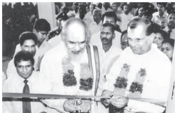
The Primary Medical Care Centre built at Tholpuram in Waligamam West, with funds from Rajpadsam Sri Rangapadsam, of the same village and now an economist domiciled in England was opened by the Governor of the Northern Province, G.A. Chandrasiri and Chief Minister C.V. Wigneswaran recently.