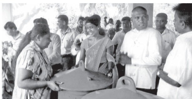
Deputy Minister of Local Government and Provincial Councils, Indika Bandaranayake distributed bins for domestic use of housewives, to collect solid waste for re-cycling. Here the Deputy Minister presents the bins to the beneficiaries in the Polgahawela electorate.